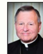
Most Reverend Gregory M. Aymond Archbishop of New Orleans