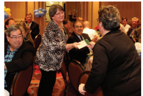
NACPA 2016 included a gala dinner with entertainment and door prizes.

A digital version of our Annual Report is available here for downloading. A paper version is available upon request.